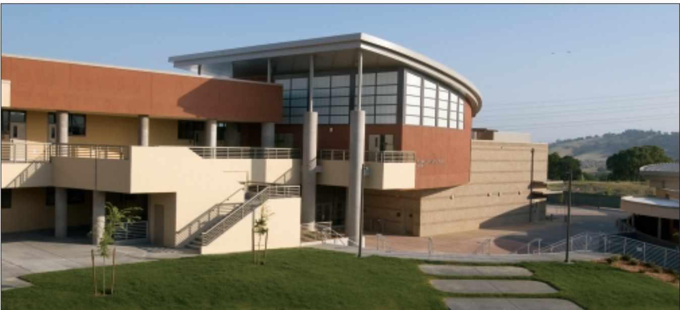
The library at Vista del Lago High School (below) won the 2009 CASH Award of Excellence.