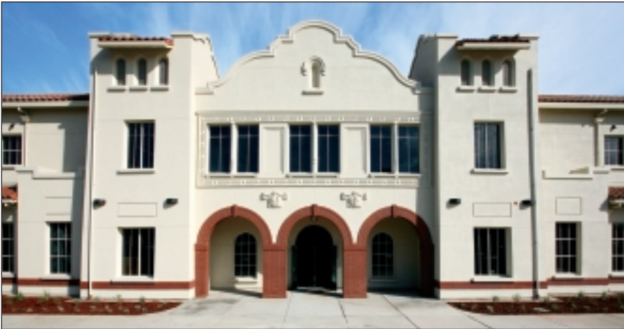
Tracy High School (left)

For more information about Barrish Pelham & Associates, visit www.barrish.com . See our previously profiled industry partners at www.arce.calpoly.edu .